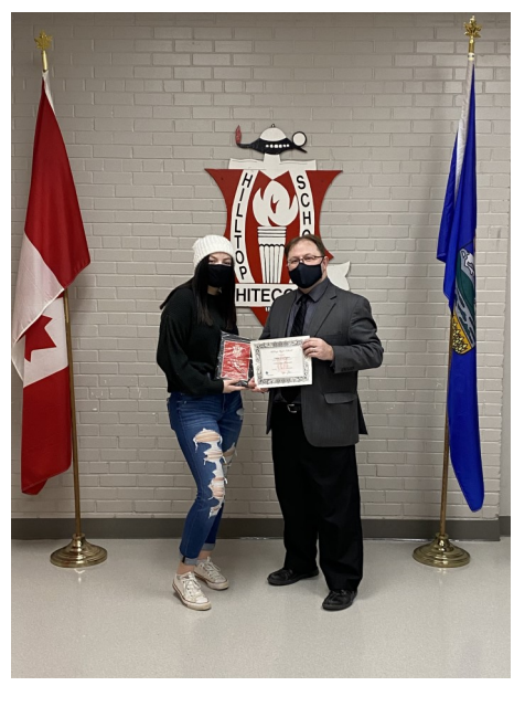
Sr High Award Recipient