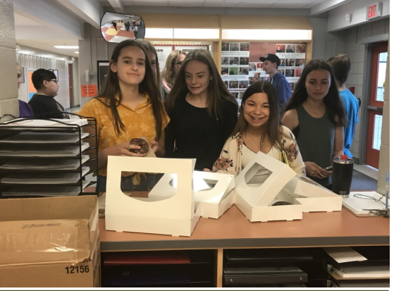
Grade 9's earn free doughnuts!