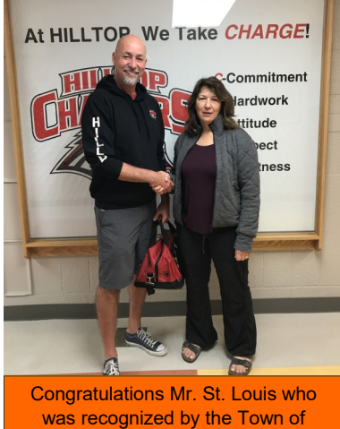
Whitecourt for National Coaches